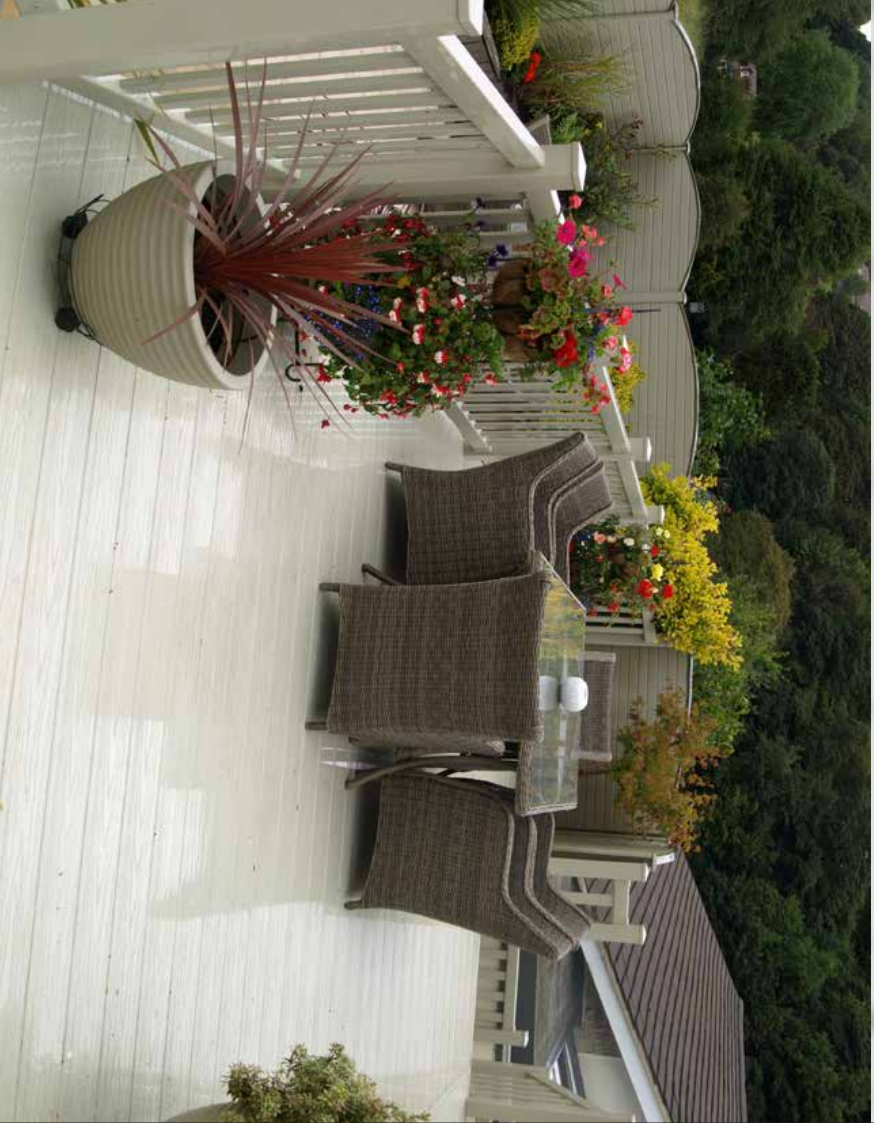
Madison beige balustrade with Premium Eco beige deck board