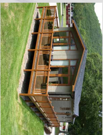
Golden Oak balustrade with contemporary pickets and glass panels

Designed to enhance the outdoor lifestyle, Fensys supply the very highest specification low maintenance UPVC products.