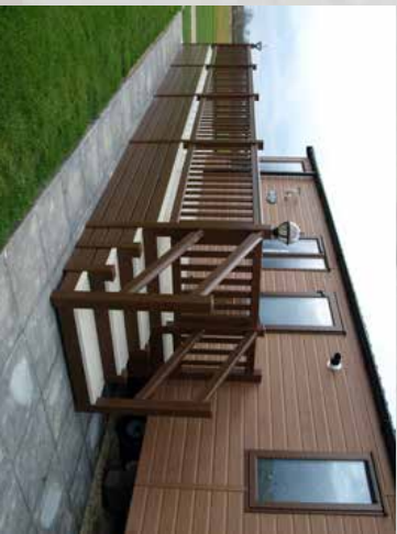
Rustic oak balustrade and cream deck board