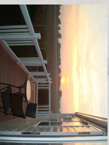
White balustrade with composite cedar deck board