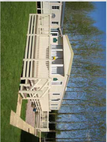
Cream balustrade with Antique Oak deck board