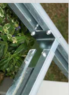
Half-tee cross bearer bracket