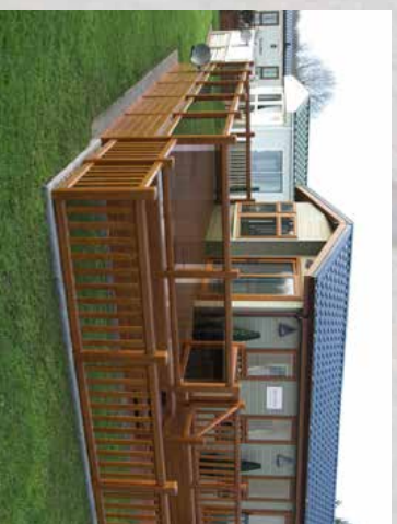
Golden Oak balustrade with additional fencing area