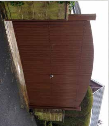
Double driveway gate in Rustic Oak

The Fensys gate range offers low maintenance whilst having a stylish visual appeal. Designed to last, the unique welded gate frame system is exceptionally strong yet light-weight.