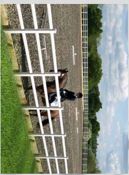
Ranch style fencing

Attractive, practical and suitable for a host of applications, the Fensys range of ranch, picket and balustrade style fencing offers a fit and forget solution when compared to traditional wooden alternatives.