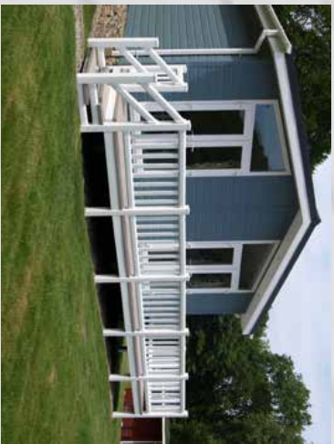
Contemporary white balustrade with Tawny deck board