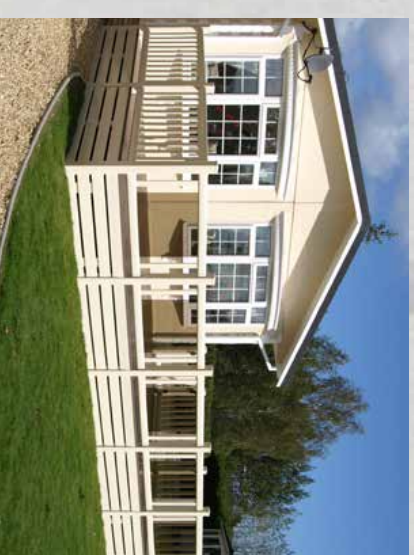
Cream balustrade with bronze glass panels and ranch style skirting

Whether you are looking for a relaxing space, an entertainment area or a practical application, the versatility of the Fensys range ensures we can create an engaging solution.