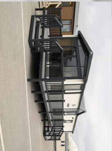
Gayle grey balustrade with smoked glass panels