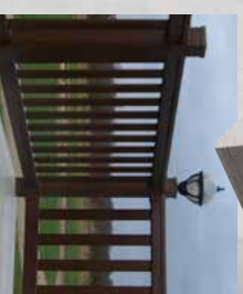
Contemporary pickets Available in all colours