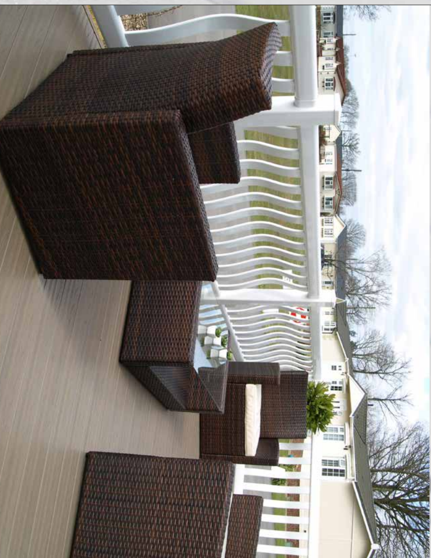
Contemporary white balustrade with bowed pickets and Premium Excel deck board

The key to good design is not only to make something that looks and feels good but also to create something that works. The Fensys range of decking and veranda products satisfies both these requirements with our industry leading deck board, balustrade and precision engineered sub-frame components.