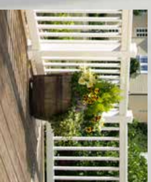
Madison pickets Available in white, cream & beige