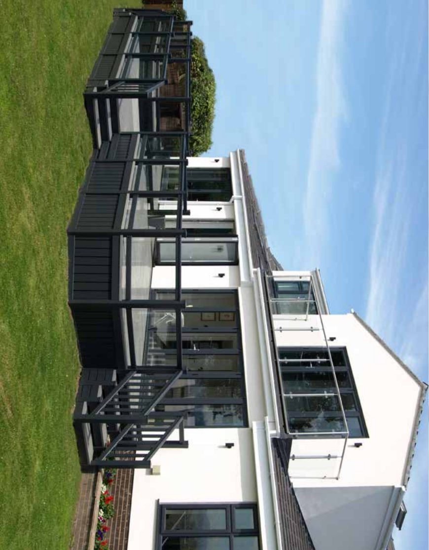
Georgian Gayle grey balustrade, Driftwood deck board, glass panels and panel style skirting