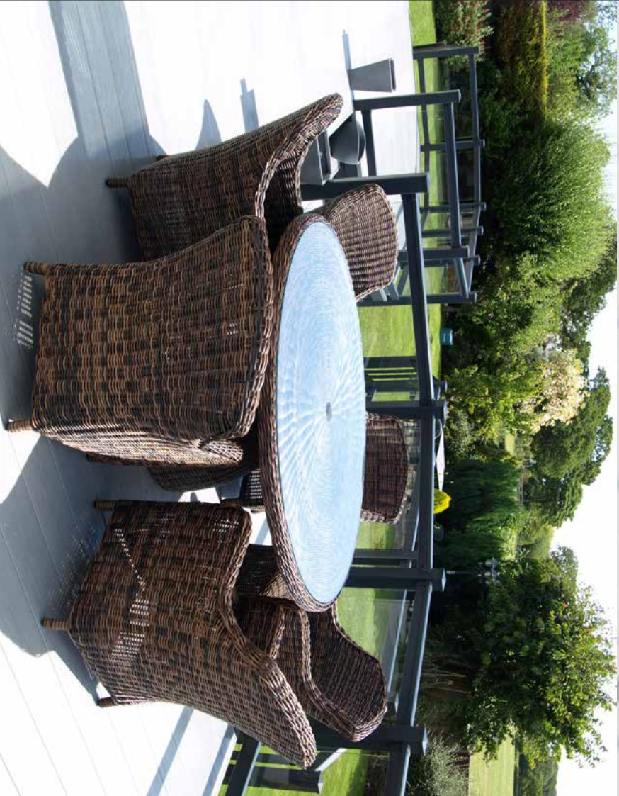
A multi-area contemporary garden veranda with clear glass panels