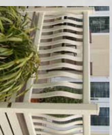
Bowed pickets Available in white, cream & beige

The range incorporates a variety of handrail and picket style options to suit every customers design ideas.