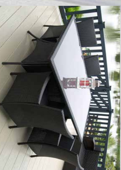
Gayle Grey balustrade with pickets and beige deck board

Whether you are looking for a relaxing space, an entertainment area or a practical application, the versatility of the Fensys range ensures we can create an engaging solution.