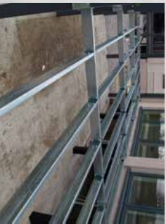
Galvanised steel sub-frame