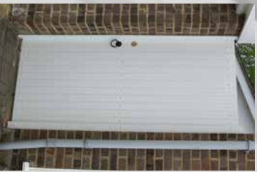
Garden gate in white

Aesthetically pleasing low maintenance solution