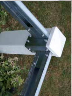
2-way corner bracket