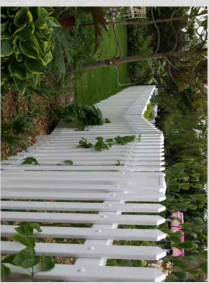
Picket style fencing