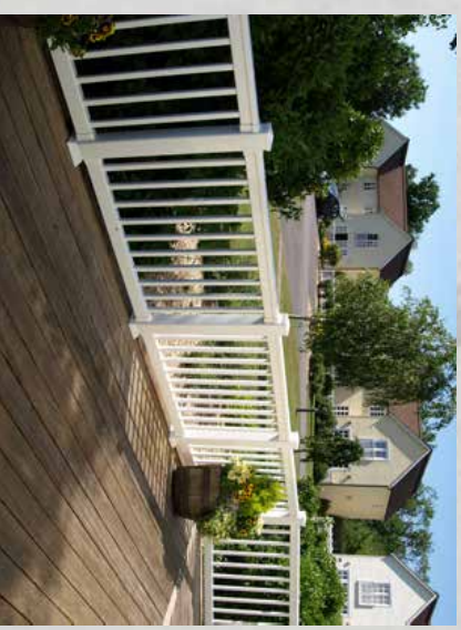
Balustrade style fencing