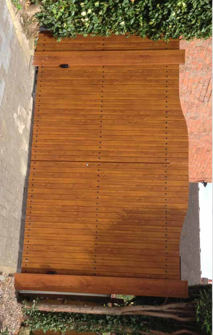
Double driveway gate in Golden Oak

FENSYS™ Decking without compromise UPVC GATE SYSTEM